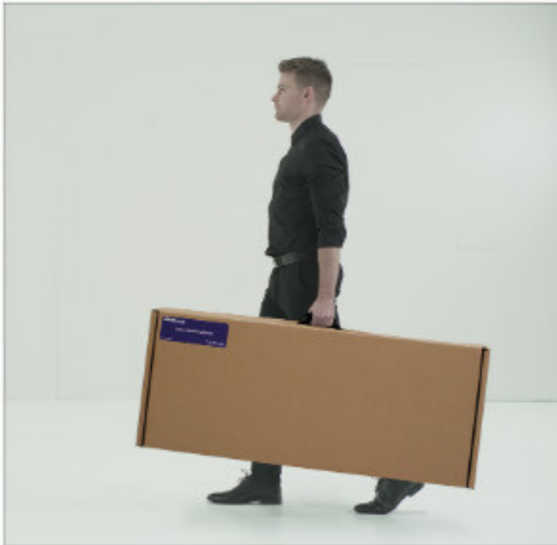
The entire system packs neatly into a slim padded transport box