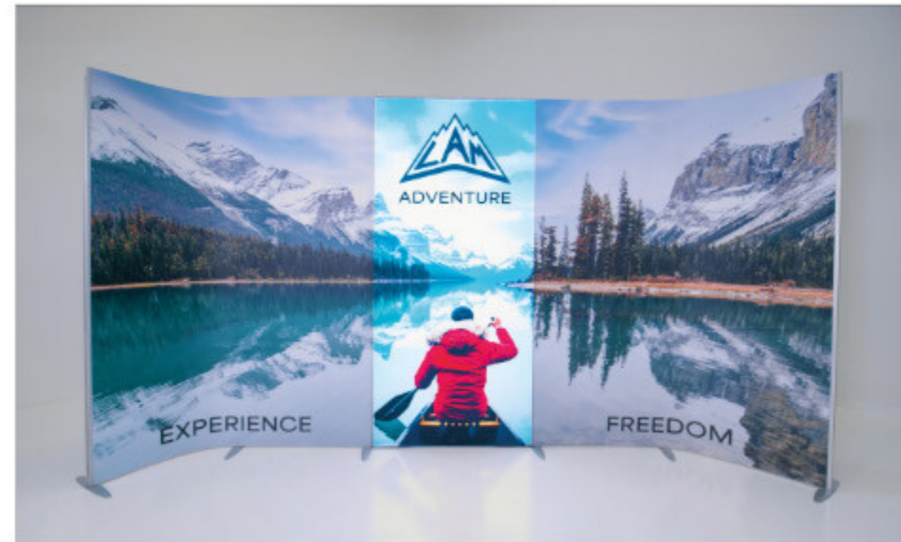
Create a seamless link between traditional rollable graphics and back-lit graphics