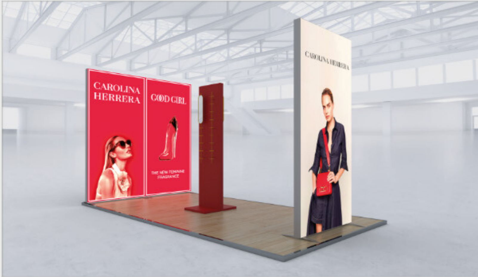
Carolina Herrera - Back-wall and free-standing Lumen modules