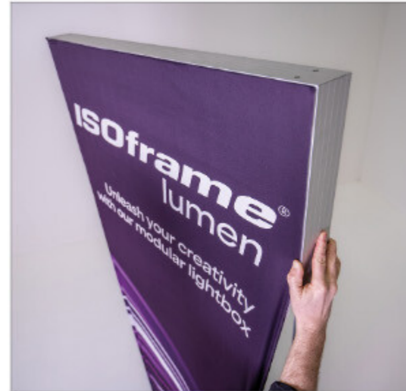
Simple, tool-less assembly