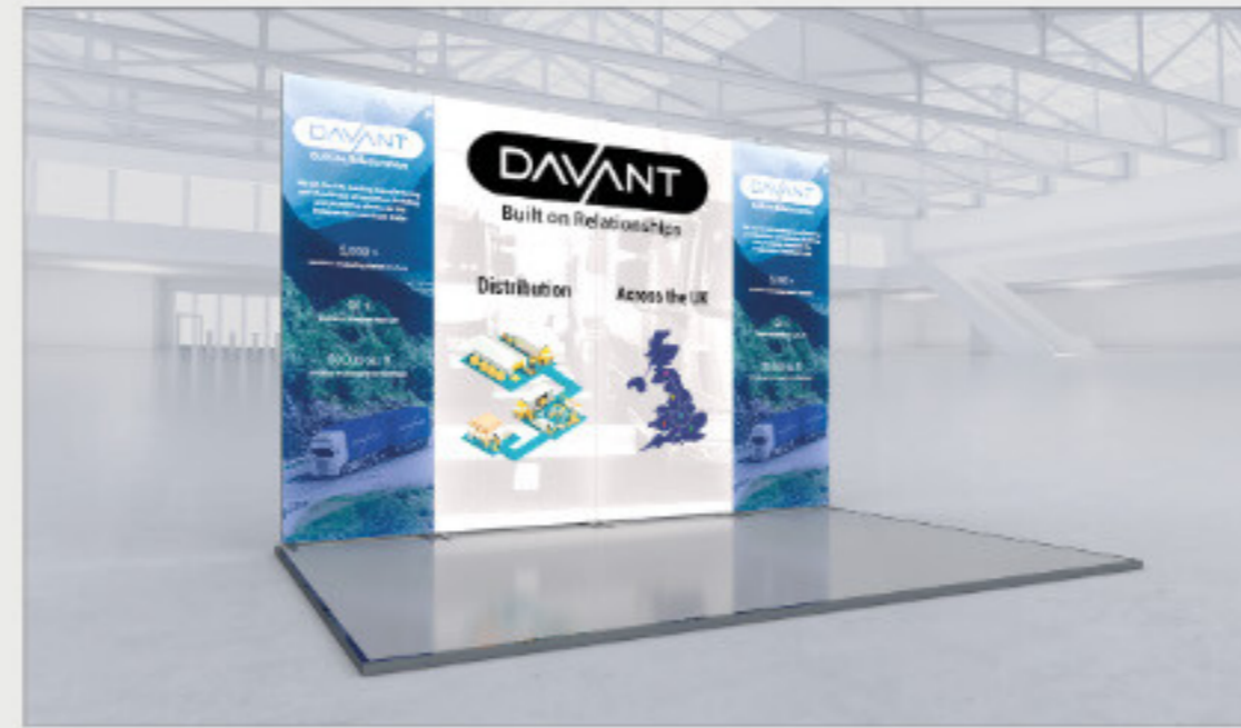
Davant - Large back-wall of graphics