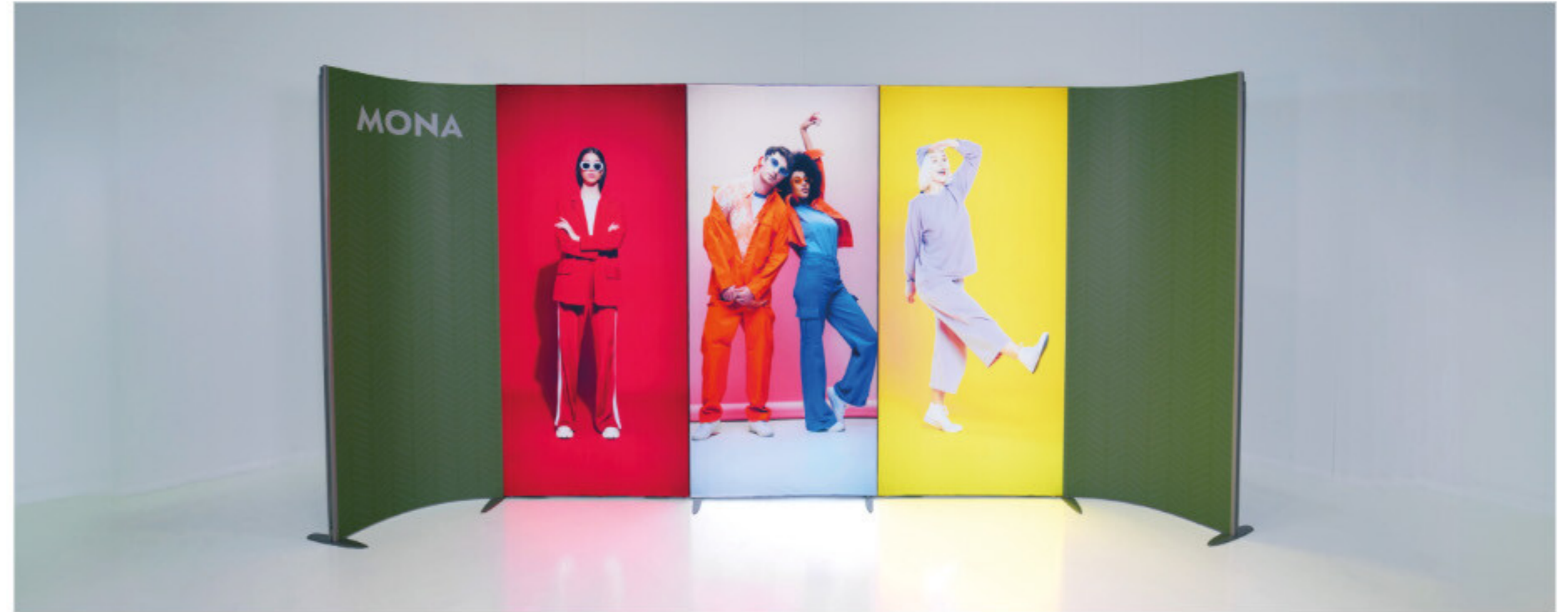
Add multiple ISOframe Lumen modules into your new or existing Wave exhibition stand

Why not add freestanding Lumen Modules into your event space for a stunning display that will leave your competitors in the shade.