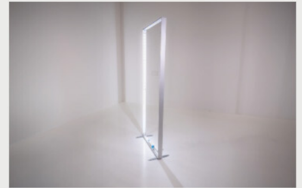
LED lights sit comfortably in the aluminium framework