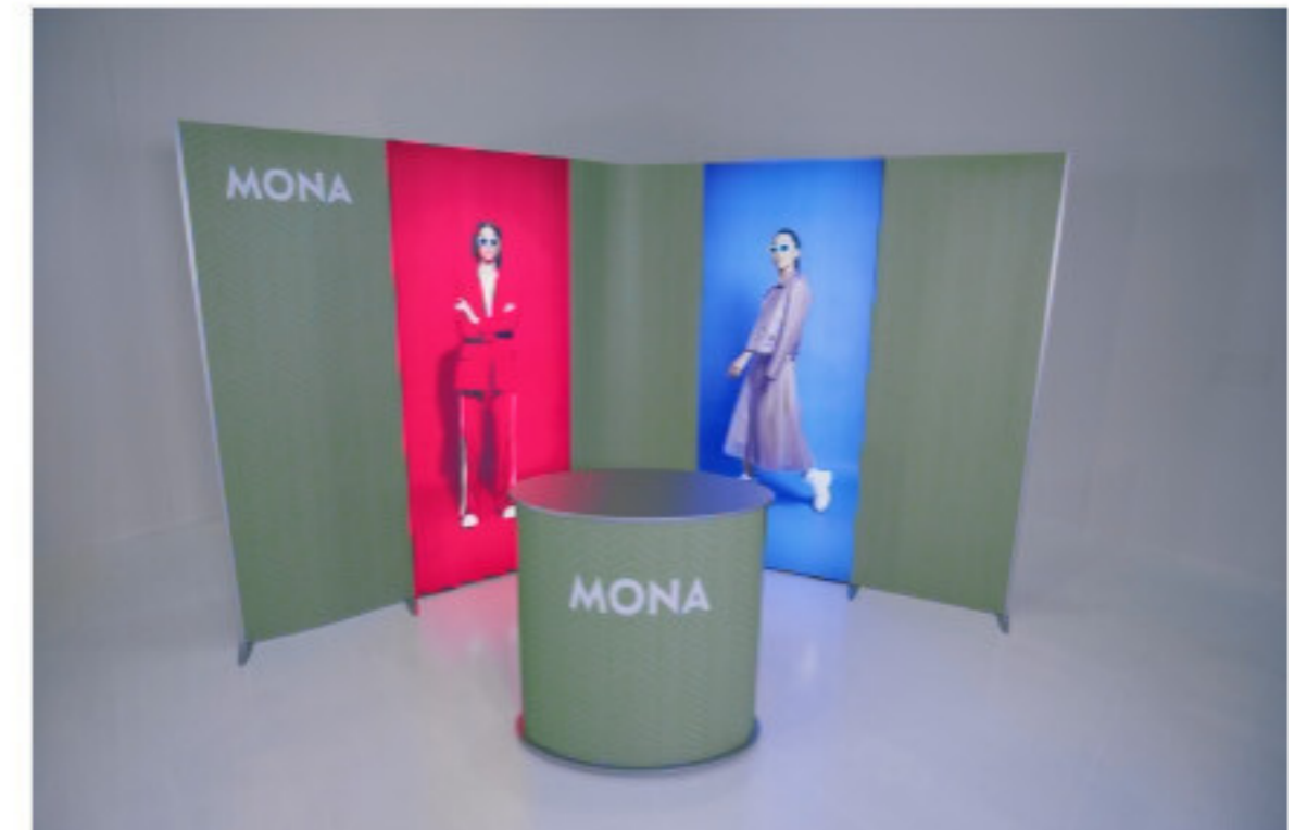
Tool-less assembly and magnetic integration into the ISOframe Wave framework