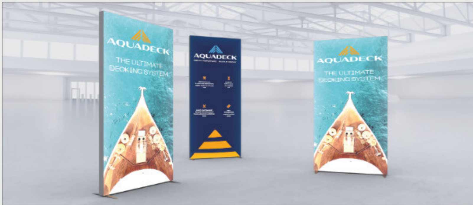
Aquadeck - Free-standing Lumen panels used to enhance your exhibition space