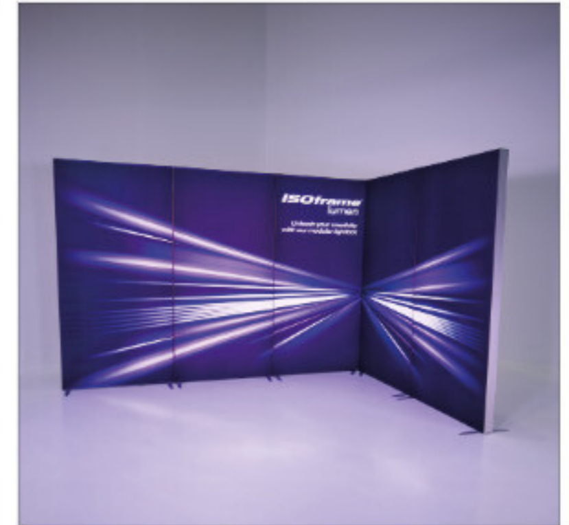
Ability to magnetically join Lumen panels together to create back-lit display walls