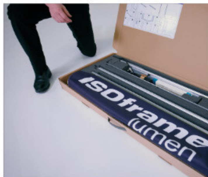
Each Lumen module is supplied within a lightweight padded transport box.