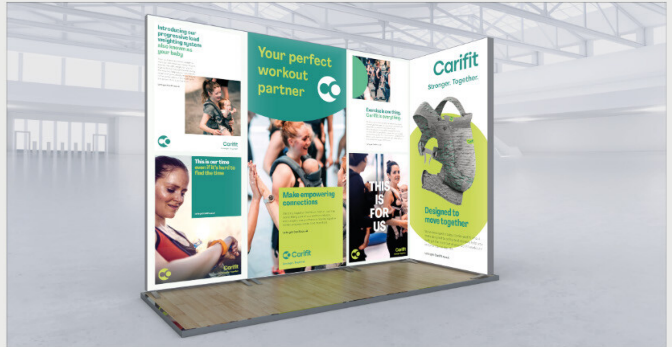
Carifit - Corner stand, configured from Lumen modules