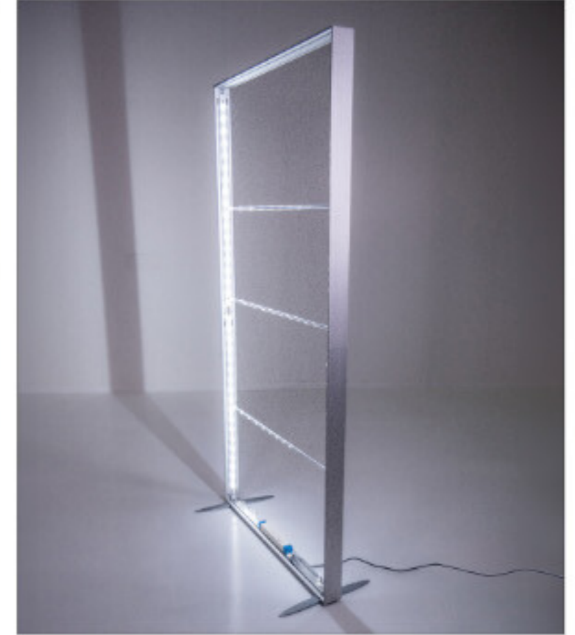
Pre-installed LEDs sit protected in the aluminium frame