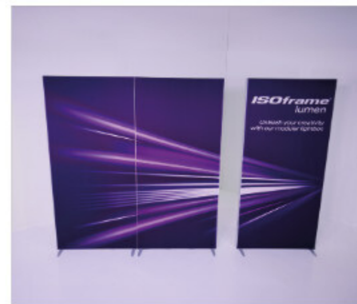
Lumen modules connect together with magnets built into the framework.