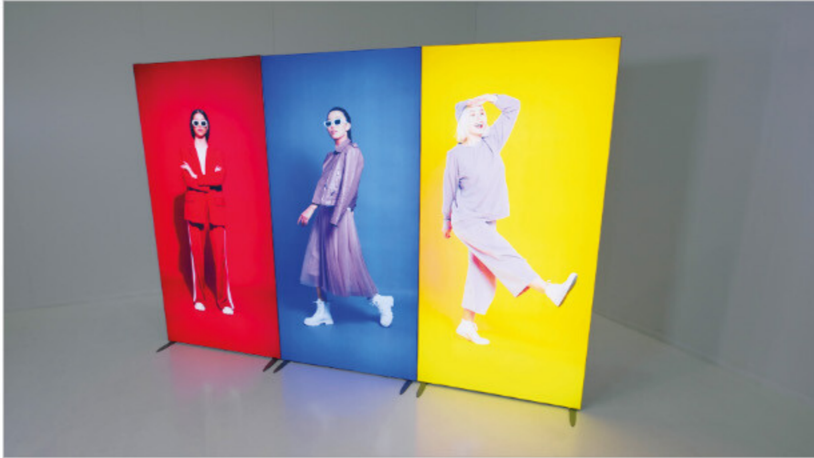
ISOframe Lumen gives you total flexibility to make a big impact for your brand at any event