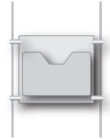
Custom sized literature holder

1 Attach 2x beams with cable literature holder anchors installed