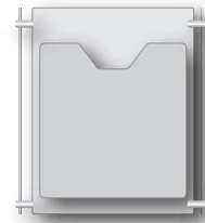
A4 Literature holder