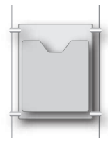
A5 Literature holder