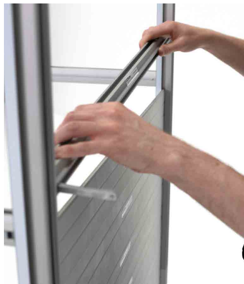
14 Attach an 800 'D' beam on top of slatwall pieces