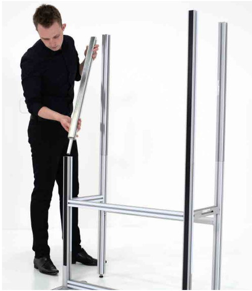
7 Fit extension posts