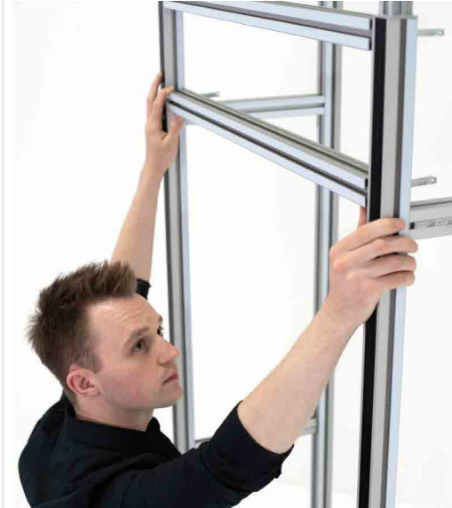
12 Add a second 800 beam between front posts 150mm between the top beam