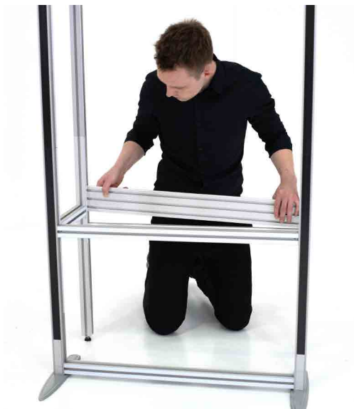
13 Lower 9x slatwall pieces between rear posts