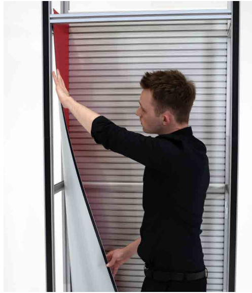
17 Fit side graphics, align curved cut out with 'D' beam at the back & adjust front beam position