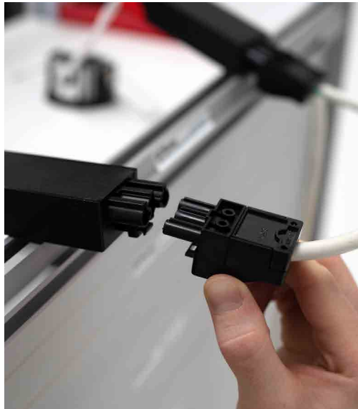
19 Connect power wires