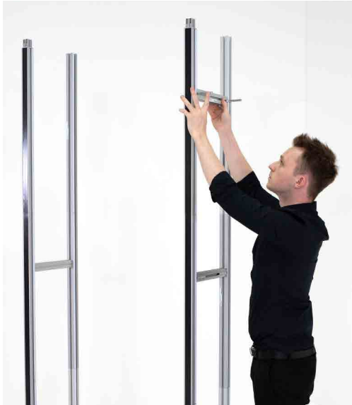
10 Join front and back posts with another 330 beam