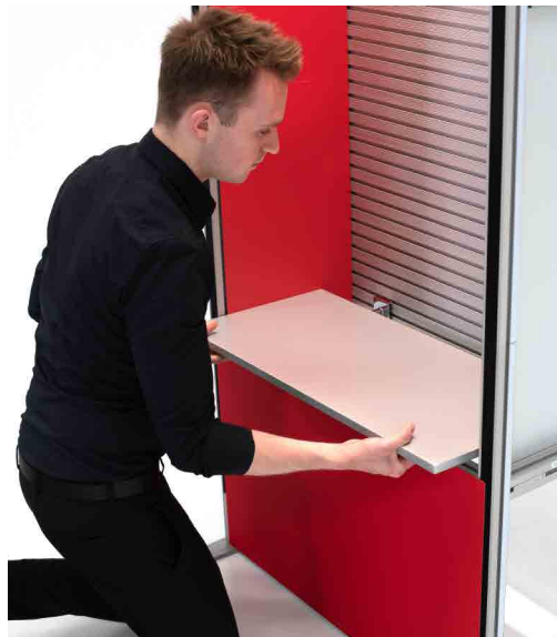
22 Fit shelf brackets into slatwall & place base shelf on top of them