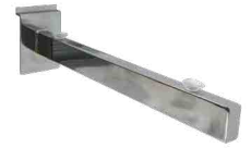
Slatwall shelf bracket IS-SW-06

1 Attach an 800 beam between two base posts. Ensure posts have steel tape on inner edges.