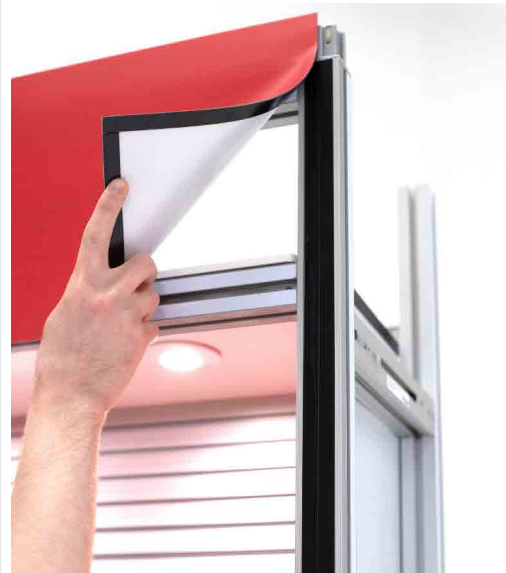
21 Apply top graphic