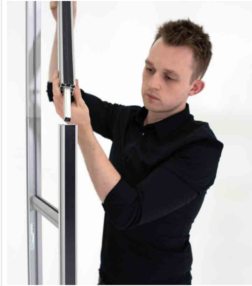
9 Fit top posts