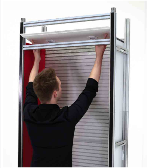
18 After adjusting front beams to match cut-outs in side graphics add the top light panel