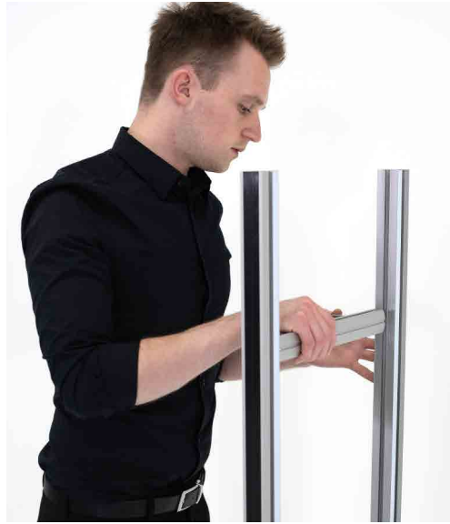
8 Attach a 330 'D' beam between the front & back posts