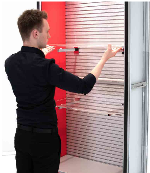
23 Fit shelf brackets into slatwall & place acrylic shelves on top of them