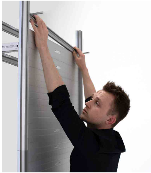
16 Attach an 800 'D' beam on top of slatwall pieces