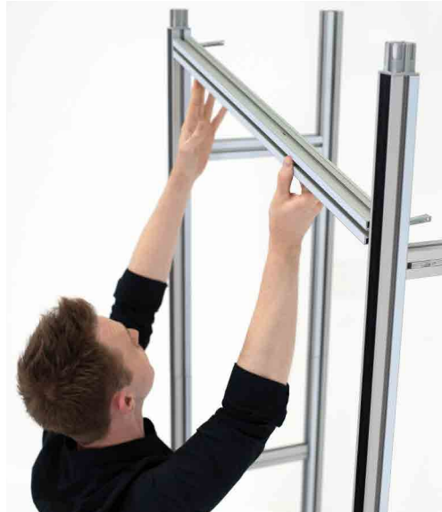
11 Fit an 800 beam at the top between the front posts