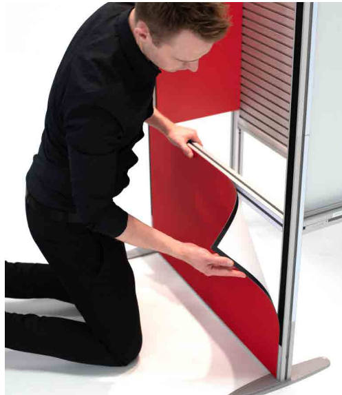
20 Apply bottom graphic